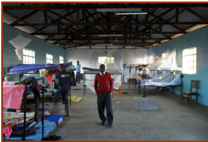
The newly completed dormitory.

We all got covered in paint whilst painting the dormitory for the students to stay in. Quotes were painted in English on one wall, in Kiswahili on the opposite and a handprint tree on another. After Catherine showed us round all the classrooms, we introduced ourselves to the students and told them what we want to do in the future.