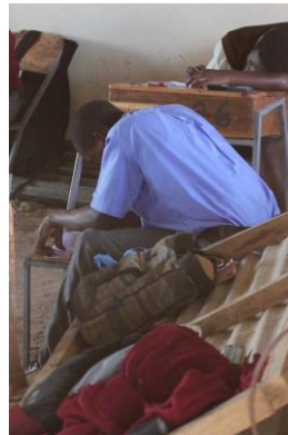
Using planks of wood against the wall as seating and a chair as a desk.