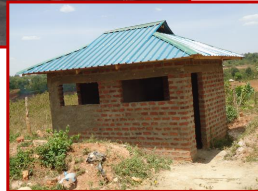
From top – Temporary Girls Dormitory Septic Tank Temporary Girls bathroom Toilets