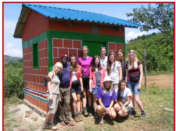
Some of the TGGS team at the school

Student at Torquay Girls' Grammar School