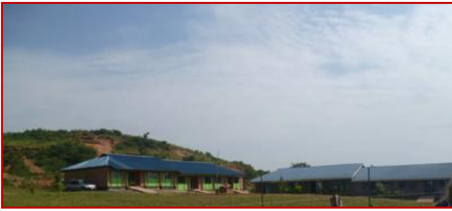
The school site